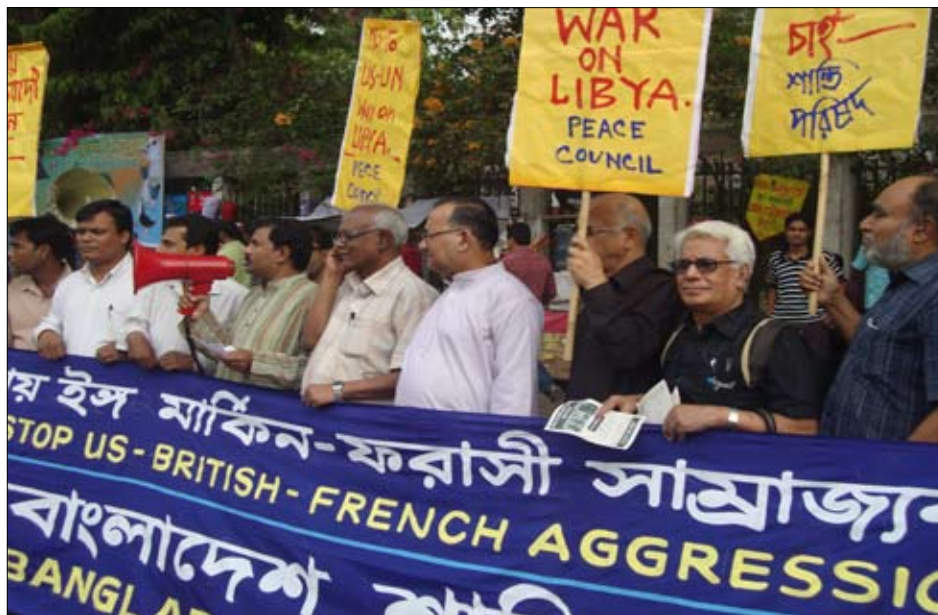
Bangladesh Peace Council demonstration against US-NATO aggression in Libya

13. The conference expresses its solidarity with the people of Nepal and hope that it will carry forward the peace